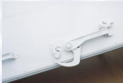
4 rows of blind fixing hinges for smooth exterior, 77 lock