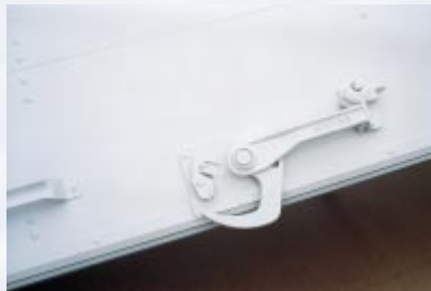
4 rows of hinges, 77 lock