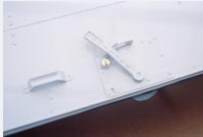
4 rows of hinges, 70 lock c/w Yale cylinder