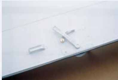
4 rows of blind fixing hinges for smooth exterior, 70 lock c/w Yale cylinder