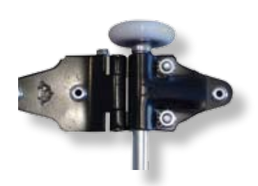
Nylon roller with bearings end hinge and roller carrier. Removable cap allows roller change without removing hinge.